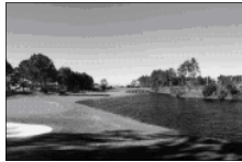
The scenic course is timeless in its design and beauty